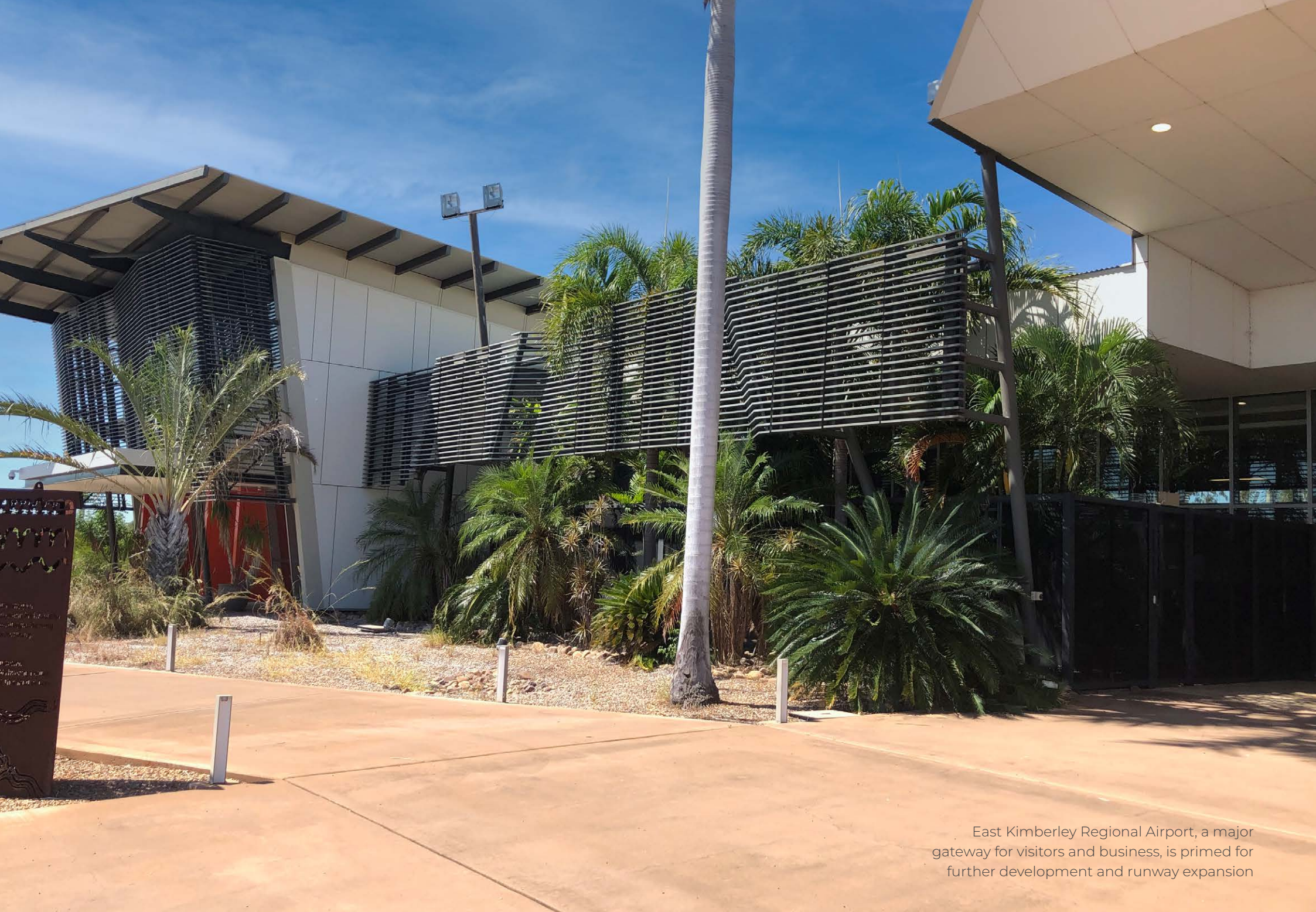
East Kimberley Regional Airport, a major gateway for visitors and business, is primed for further development and runway expansion