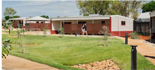
New staff accommodation at Juniper Fitzroy Crossing addresses housing shortages in the area.