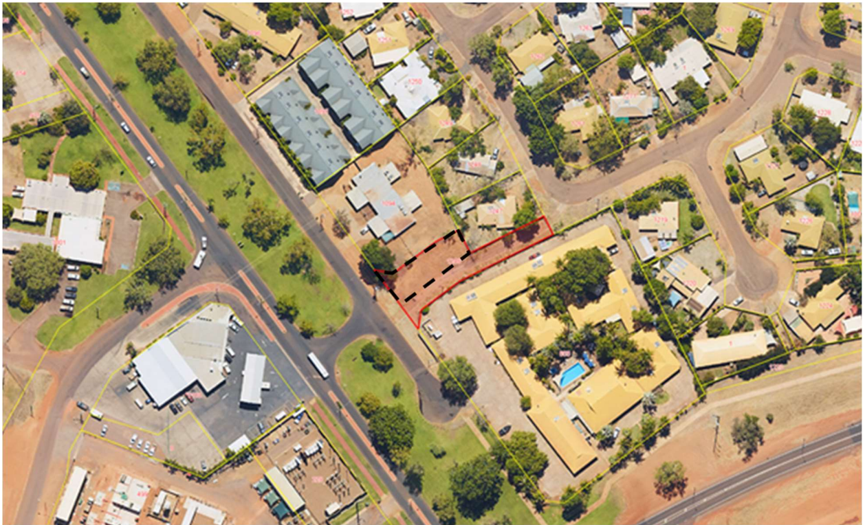
Map showing Reserve 42799

The submission received from MG Dawang Land Pty Ltd (MG Dawang) is with respect to a portion of their freehold Lot 5012 on Deposited Plan 406531, which has been proposed by the Department of Planning, Lands and Heritage (DPLH) to be rezoned from Settlement to Agriculture - State or Regional Significance. MG Dawang does not support the change in zoning and its preference is for the western portion of Lot 5012 to be zoned Settlement, in addition to Lots 859, 937 and 936, which comprise the Jimbilum/Yirrallalm Aboriginal Settlement. The Settlement zone will allow greater flexibility for future community use. The maps below show the proposed zoning change - Agriculture - State or Regional zoning in green and Settlement zoning in orange.