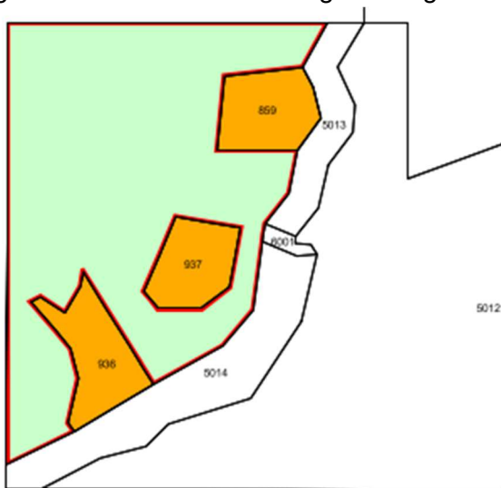
Map showing proposed zoning zoning

The submission received from MG Dawang Land Pty Ltd (MG Dawang) is with respect to a portion of their freehold Lot 5012 on Deposited Plan 406531, which has been proposed by the Department of Planning, Lands and Heritage (DPLH) to be rezoned from Settlement to Agriculture - State or Regional Significance. MG Dawang does not support the change in zoning and its preference is for the western portion of Lot 5012 to be zoned Settlement, in addition to Lots 859, 937 and 936, which comprise the Jimbilum/Yirrallalm Aboriginal Settlement. The Settlement zone will allow greater flexibility for future community use. The maps below show the proposed zoning change - Agriculture - State or Regional zoning in green and Settlement zoning in orange.