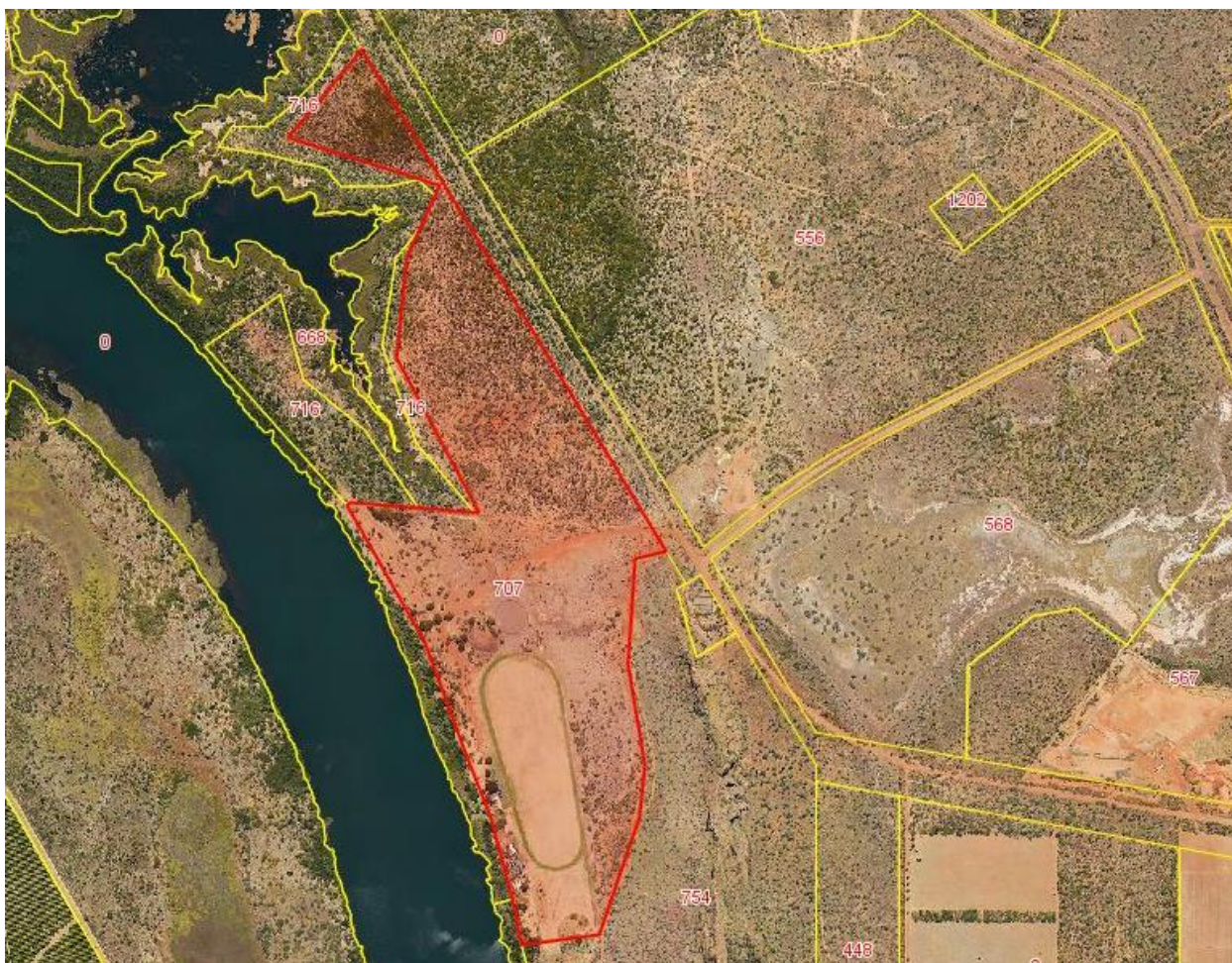
Locality Plan: Lot 707 Drovers Road, Kununurra

The land is generally flat and contains several lease areas including: the Kununurra Race Club, the Kununurra Rodeo and Campdraft Association (formerly Kununurra Bushmen's Rodeo Association), the Kununurra Dragon Boat Club and Kimberley Action Sports. Each lease area contains development associated with the particular land use or group. There is also a Designated Fenced Area which is licensed and located to the north-east of the Kununurra Race Club and Kununurra Rodeo and Campdraft Association lease areas and a Campground (Licenced) Area, which is where the new ablutions are proposed to be constructed.