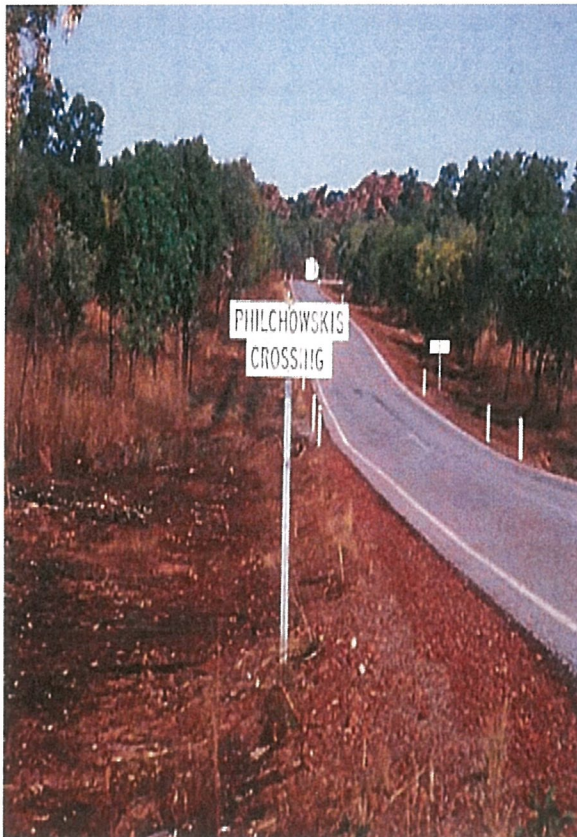
Previous Sign - 1977